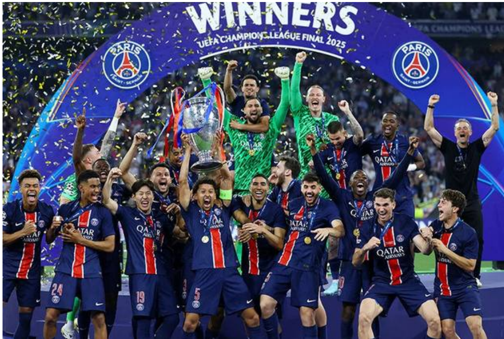
Paris Saint-Germain, One of France's Most Prestigious Football Clubs

SUIISO JAPAN Co., Ltd. December 24, 2025 | 10:26 AM JST